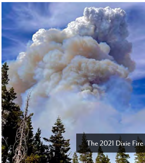
The 2021 Dixie Fire

In the past several years, it has seemed like wildfires have gotten more and more extreme. According to the Cal Fire wildfire statistics, from January 2020 – December 2021, California experienced 15,969 wildfires – that's not counting any that have occurred this year! With 6 of the top 20 largest fires in the State history occurring in 2021. Approximately 4,099,653 acres burned during the past two years – that's roughly 3.9% of our State! And while it may seem like there's not much left to burn, Cal Fire is predicting another bad fire season for 2022 – "These continued dry conditions, with above normal temperatures through spring, will leave fuel moisture levels lower than normal,