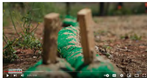
Camp Fire Filtrex Fire Remediation Project.