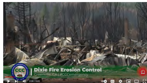
Dixie Fire Erosion Control.

communities with fire remediation. They not only trained the community about how to prevent erosion by installing erosion control measures, but they also provided fire remediation, jobs and training for locals who lost their livelihood and homes to the fire, and helped install thousands of feet of Siltsoxx used for erosion control and removal of pollutants. Watch these videos to see some of the fire remediation work needed post-fire, and to see how compost socks can be used to filter and improve water quality after a fire and reduce erosion.